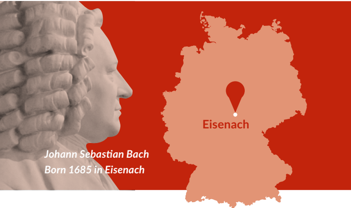
Johann Sebastian Bach Born 1685 in Eisenach

In the midst of four valleys, Eisenach lies picturesquely at the foot of Wartburg Castle.